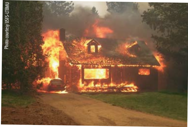
This house was ignited by burning embers landing on vulnerable spots. Notice the adjacent forest is not burning.